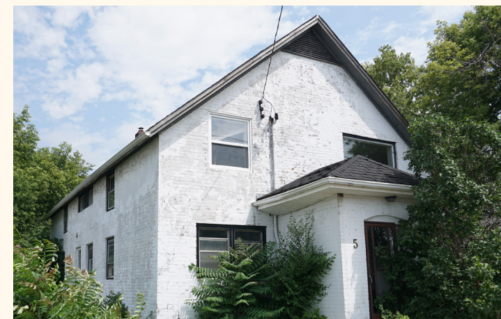
Former Trinity Methodist Church