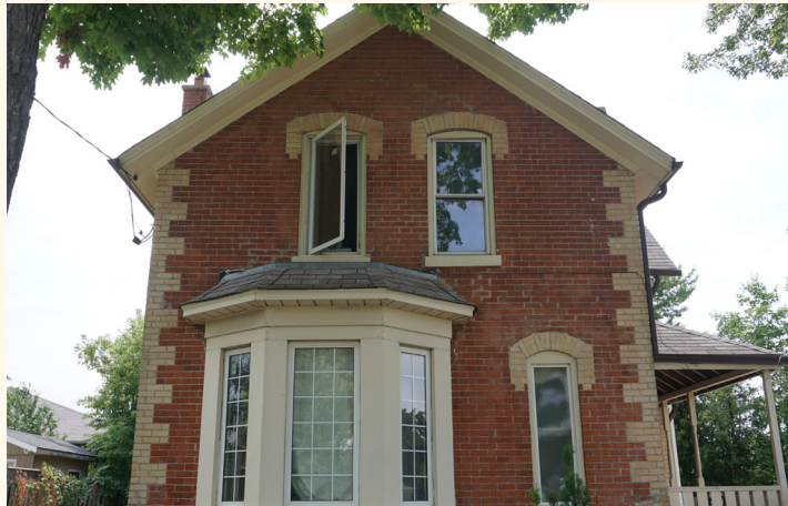
David Tomlinson House