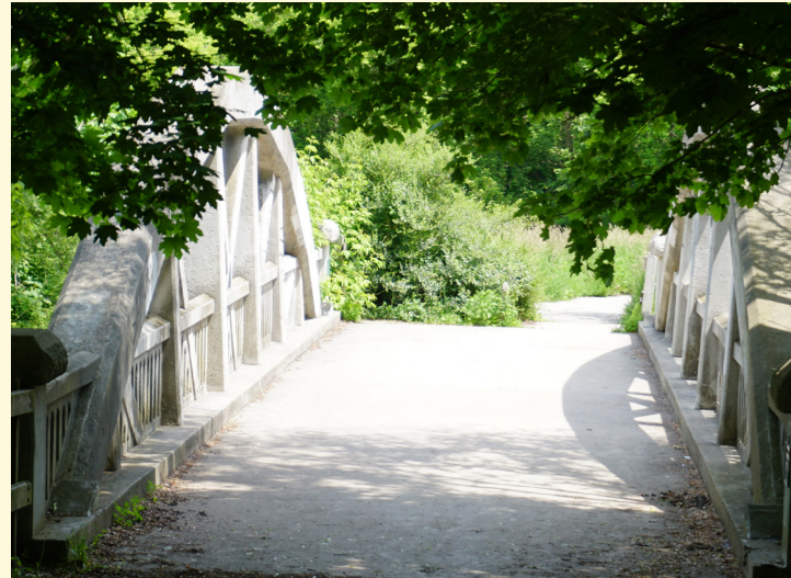
Middle Road Bridge