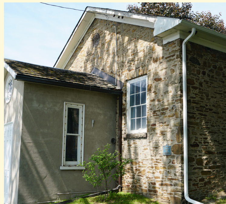
Dixie Union Chapel