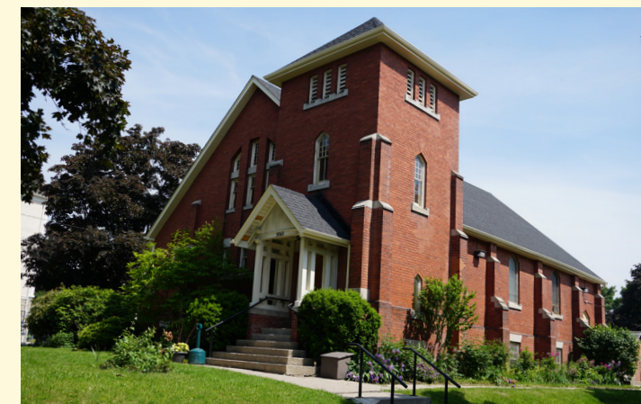
Dixie Presbyterian Church