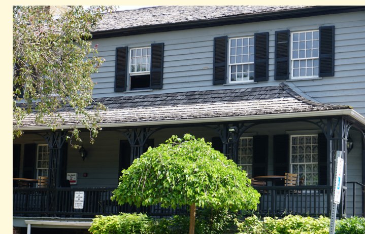
Cherry Hill House

The first St. Patrick's church was opened in 1872. It was built on the south west corner of Dundas Street and Dixie Road in a part of Toronto Township often called Irishtown. Irishtown area first drew the attention of the Catholic Diocese when a large number of Irish Catholics settled in the Dixie area during the Irish potato famine of the 1840s. St. Patrick's church served as a central location for the parish and removed the need for Irish Catholics living in the area to go to either Trafalgar or Elmbank to attend mass. The current St. Patrick's church in Dixie was opened in 1971, and the old church was torn down in 1973.