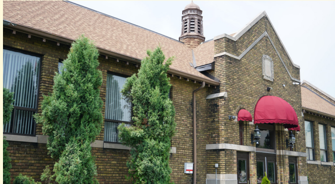
Former Dixie Public School

On the southwest side of Dixie and Dundas Roads, is the former Dixie Public School building. Opened in 1923, this four-room school was built as a replacement for the smaller log schoolhouse originally built in 1844. Increasing suburbanization in the 1950s forced the old school to close its doors in the spring of 1960 and students were transferred into the new Dixie Road Public School. For a time the building was used as an office by the Ministry of Transportation, before being purchased in 1983 by Serbian Orthodox Church St. Sava.