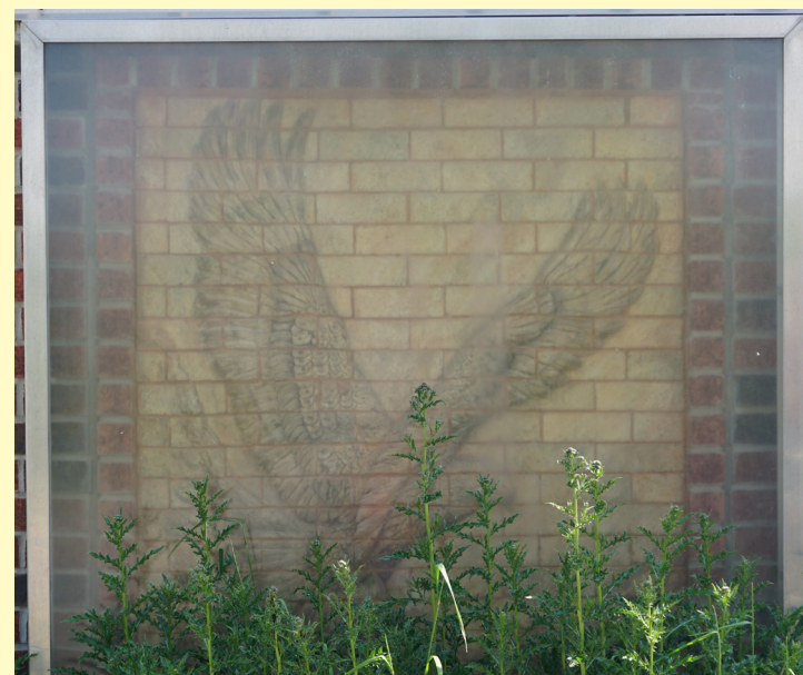
Former Cooksville Brickyard Sculpture