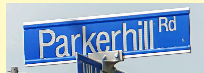
Parkerhill Road Sign