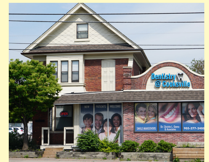
Former Cooksville Post Office and Shaver House