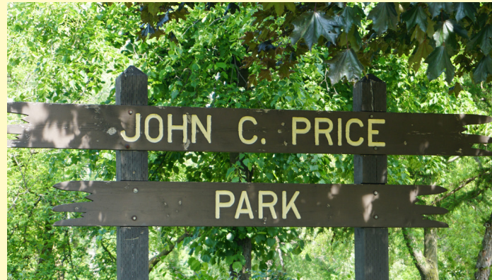
John C. Price Park Sign